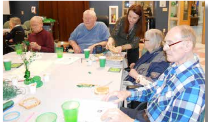
Members enjoy making food at the Memory Cafe get together.