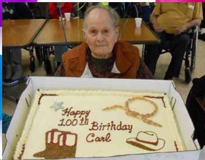
100th Birthday celebration!