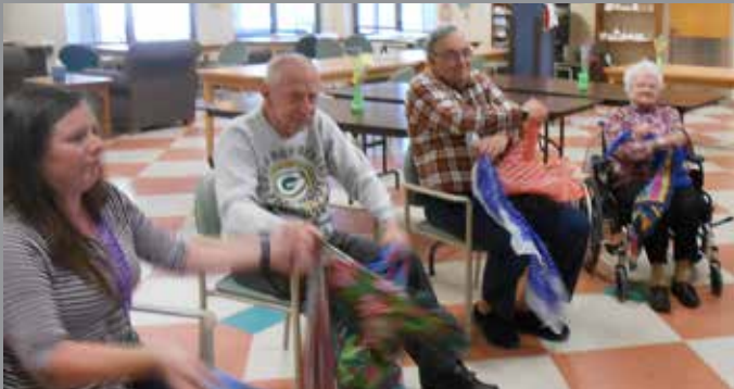
Members getting their exercise done for the day!