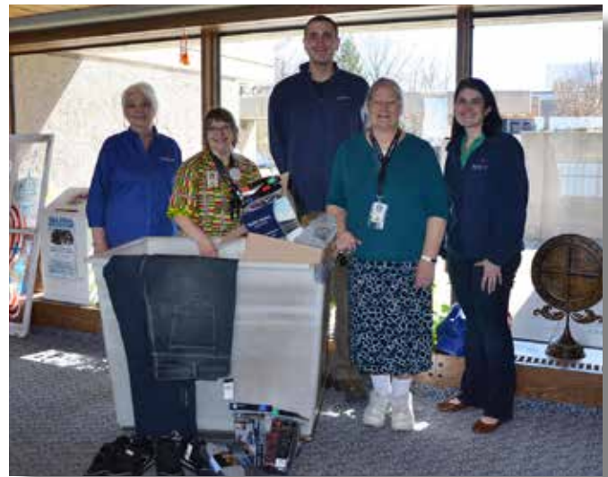
The Resource One International, LLC from Little Chute donated new shoes and clothing.