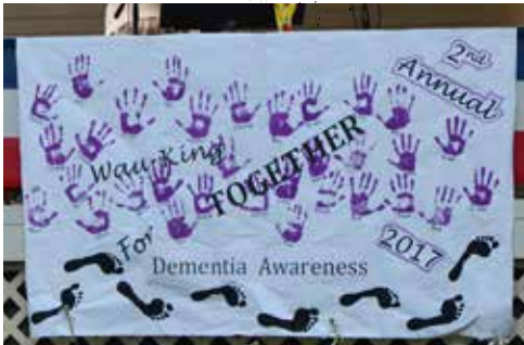
Members from Legends I and II created a banner using their hand print.

The 2nd annual Wau-King Together for Dementia Awareness event was held at the WVH-King Quadrangle Park. Thank you to all of the sponsors, donors, and everyone who helped in any way to make this event possible and successful!