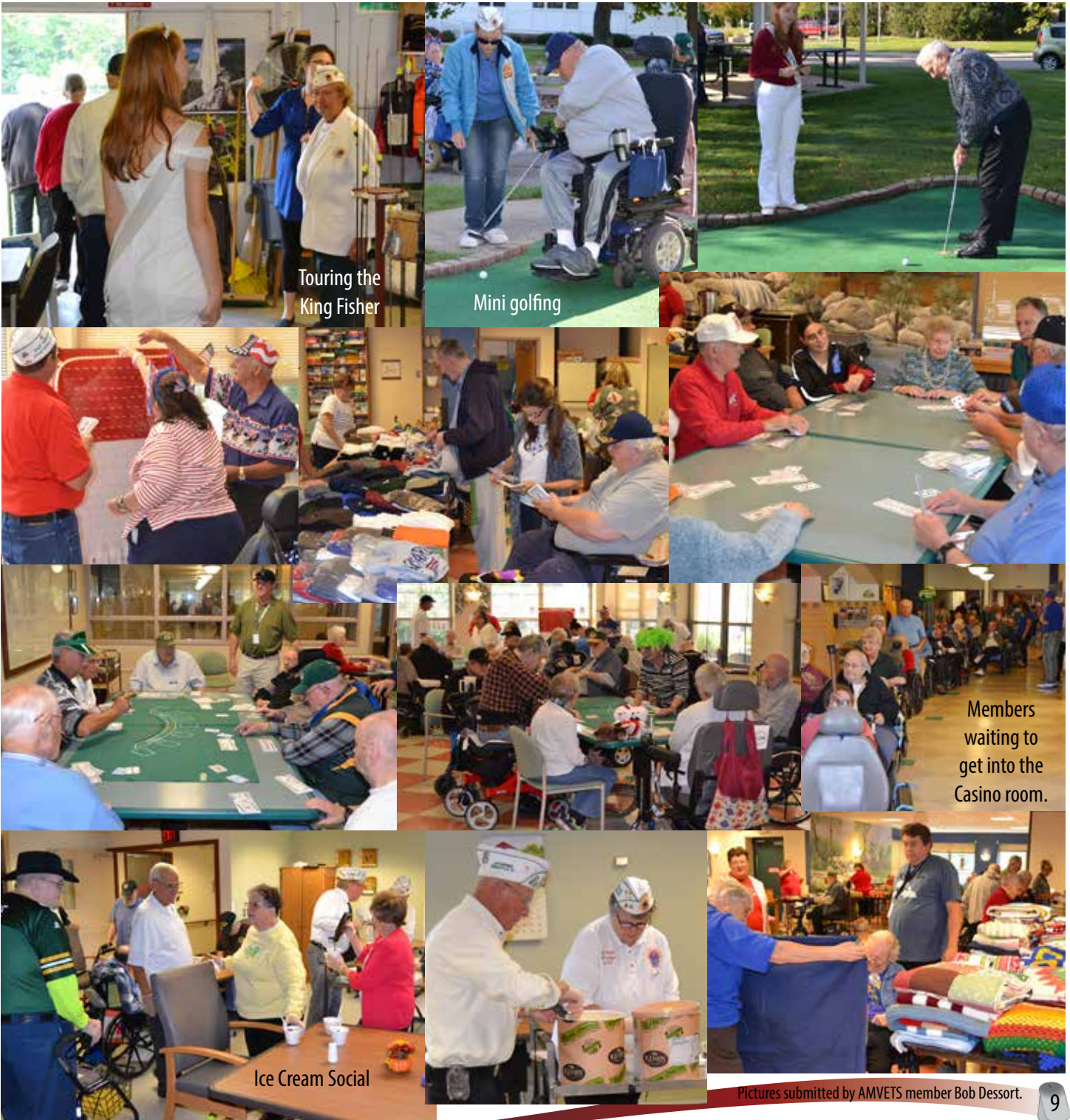
Touring the King Fisher

AMVETS and AMVETS Auxiliary recently held their annual King Weekend at King. The weekend consisted of AMVETS & AMVETS Auxiliary members touring the facility, services in the Main Chapel, sponsored a mini golf, casino day and ice cream social for the members.