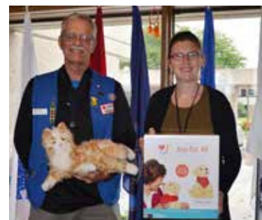
The Red Cross donated many Joy For All Pets for members to enjoy.