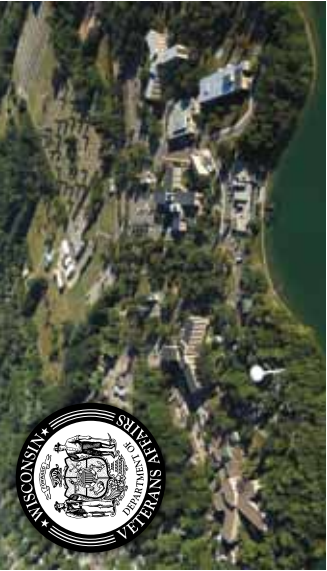
WISCONSIN VETERANS HOME AT KING N2665 County Road QQ • King, WI 54946-0600