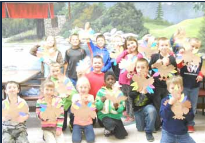
Waupaca Learning Center Students made turkeys with the members.