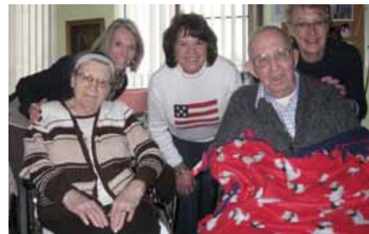
Members of The Volunteer Center of East Central Wisconsin of Appleton donated 50 handmade blankets and delivered them to some of the members.