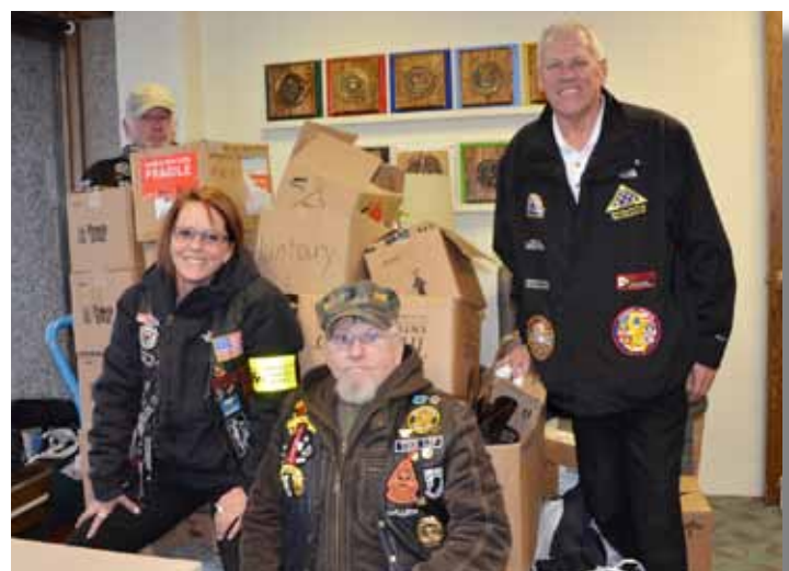
The Patriot Guard dropped off various supplies for members.

WE NEED YOUR HELP: When making a donation, please provide the full name, phone number and complete address (including zip code) of the person or group to be acknowledged.